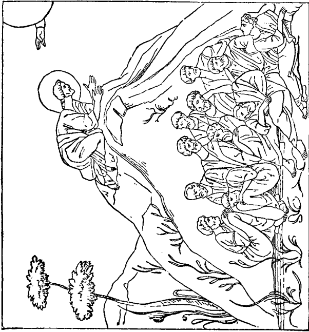
CHRIST PRAYING IN THE GARDEN.