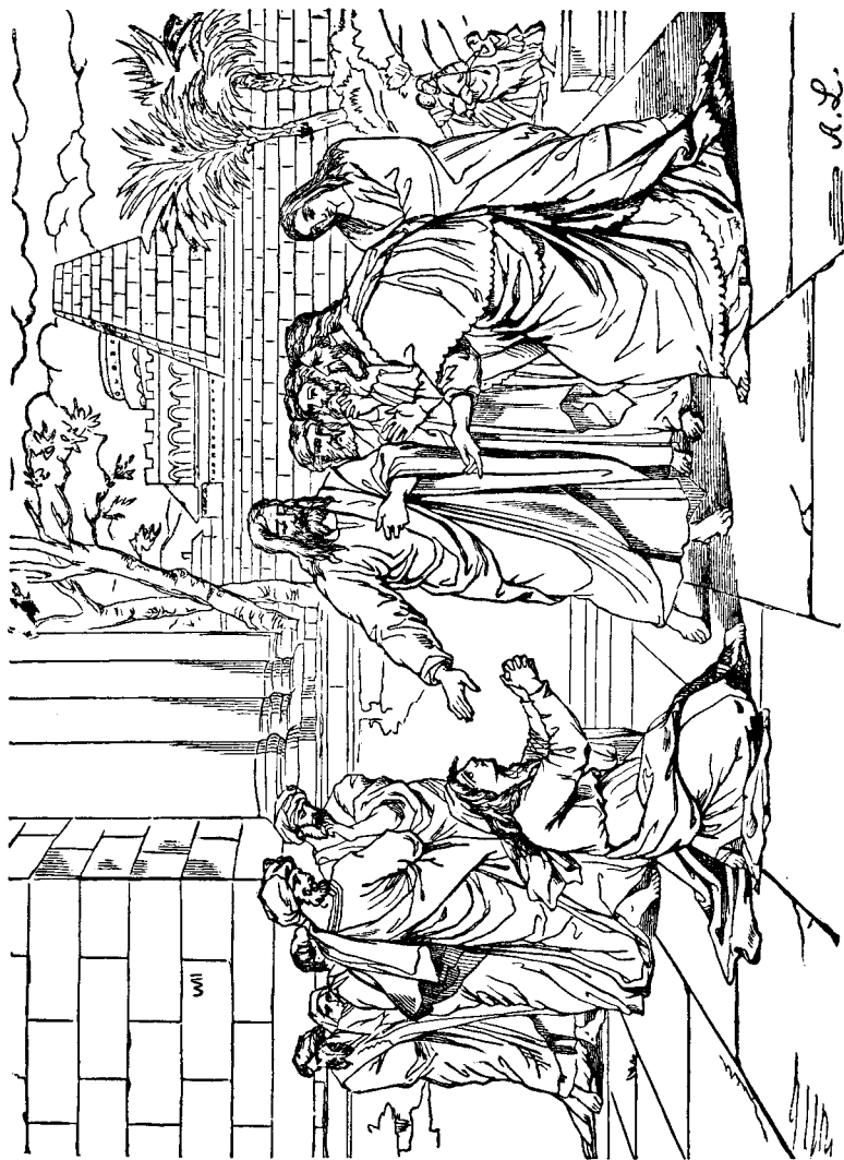
VERONICA AFFLICTED WITH AN ISSUE OF BLOOD.