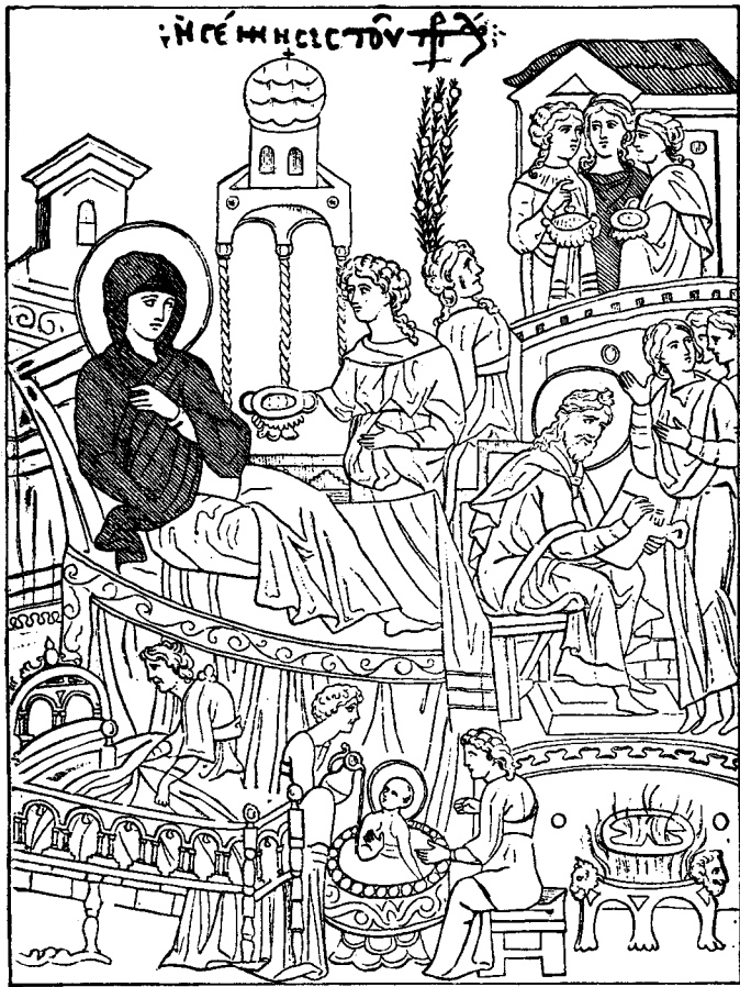
THE BIRTH OF JOHN THE BAPTIST.