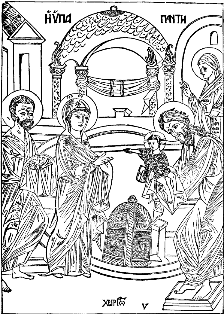
THE PRESENTATION IN THE TEMPLE.