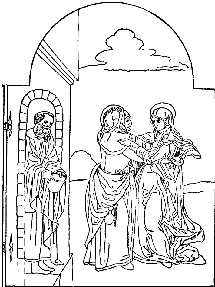
ELIZABETH RECEIVING THE VISIT OF MARY.