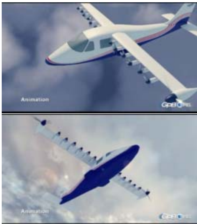
Images from NOVA, The Great Electric Airplane Race

93. NASA began with seven astronauts, known as the Mercury 7.