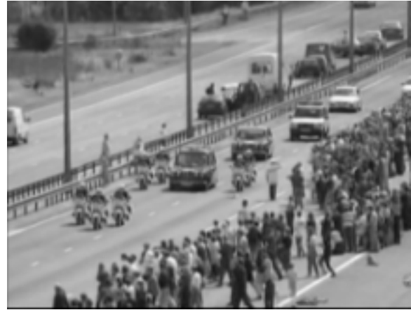
Princess Diana's Hearse